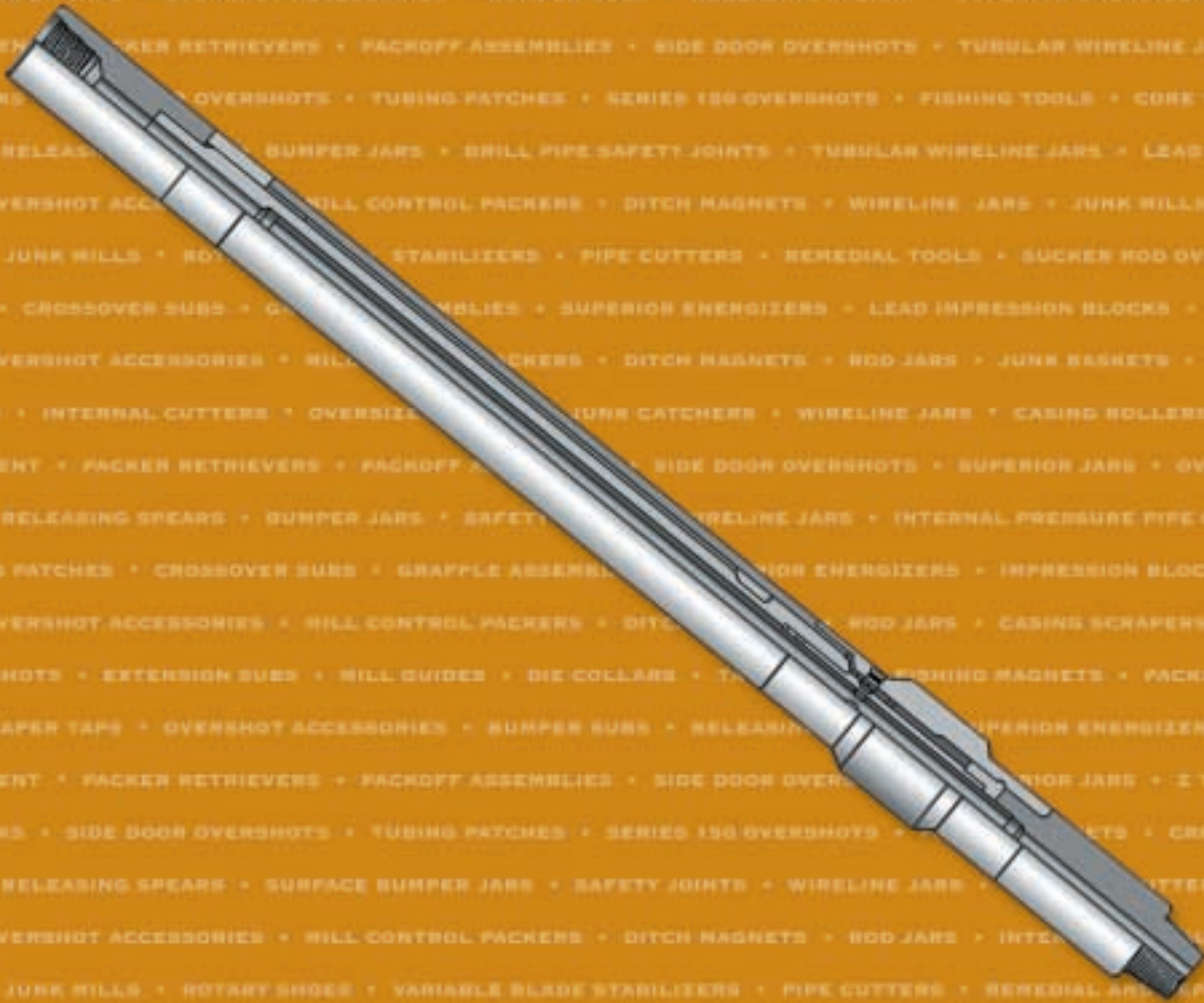
Surface Bumper Jar